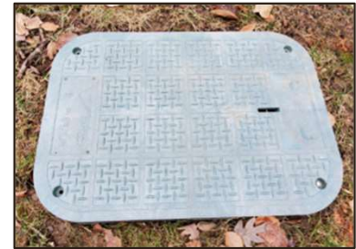
Handhole (or a Pullbox /Junction Point*)