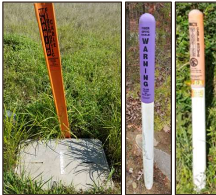
Utility Marker Post