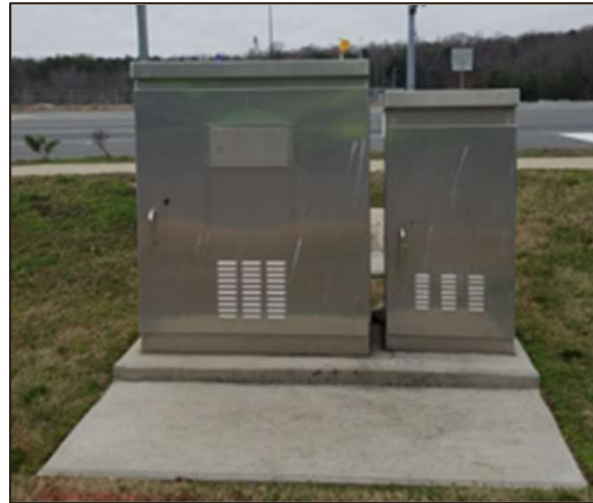
Traffic Control Cabinet