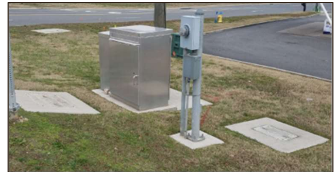
Power Meter for Traffic Facilities (to provide power for signals)