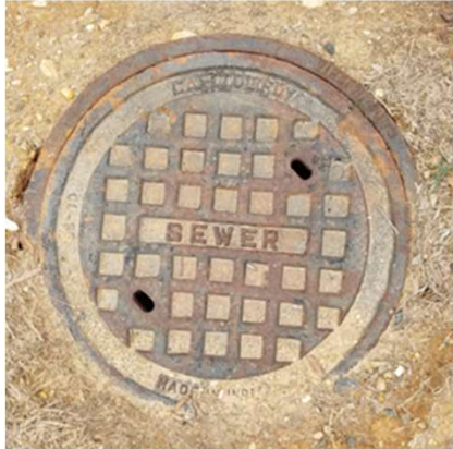
Sanitary Sewer Manholes