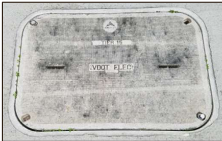
VDOT Electric Junction Box (to provide power for signals)