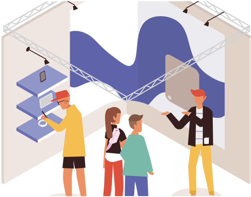
Exhibit Booth Only