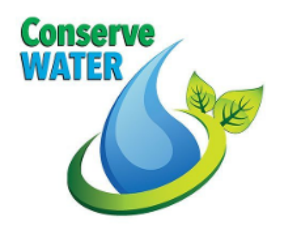
Conservation Program Evolution: As Drought Increases, Discussing Ways To Re-Think Conservation.

Returning to Palm Springs for our February 2022 conference will be a must attend in-person event. We encourage you to register early! This newsletter provides a snapshot of the topics to be discussed. A registration form is provided or you may register online at www.UrbanWater.com.