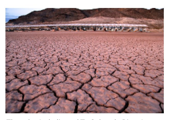
Thursday Is dedicated To Colorado River Issues: There Are Many On The Horizon.