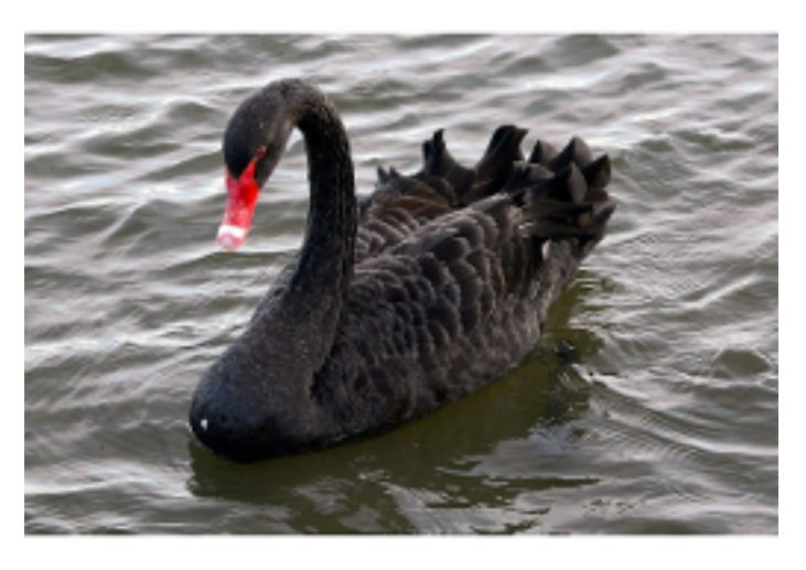
Black Swan Risk Mitigation: How To Reduce The Impact On Water Utilities Of 'Seriously Unexpected' Events