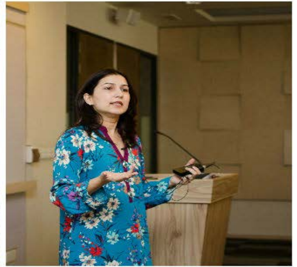
Womenx Participants presenting their business models