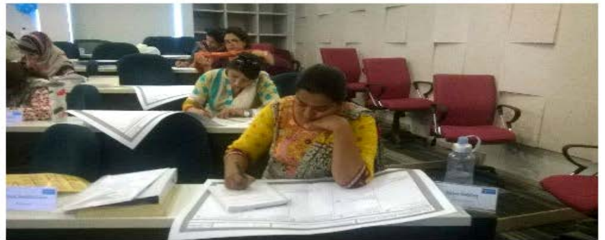
Business Model Canvas Activity