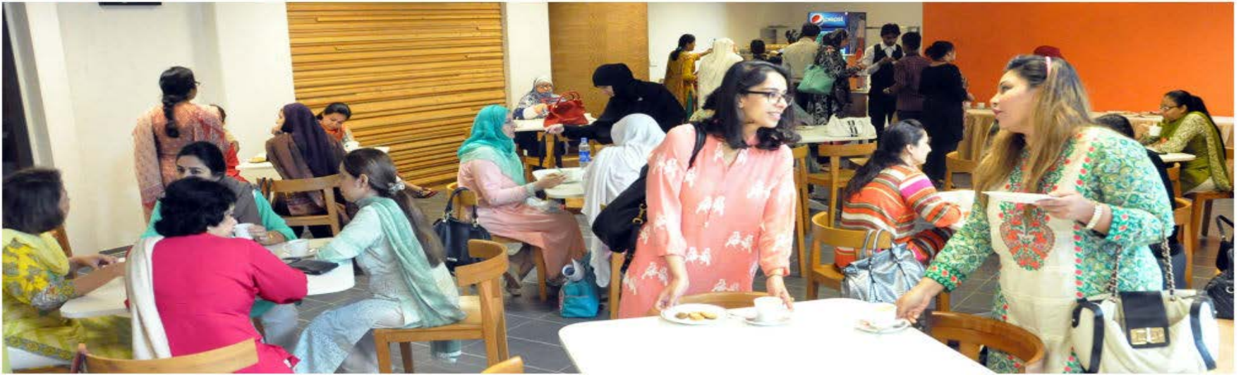
Participant's during lunch time