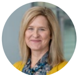
KELLY KOPP PUBLIC SERVICE AWARD