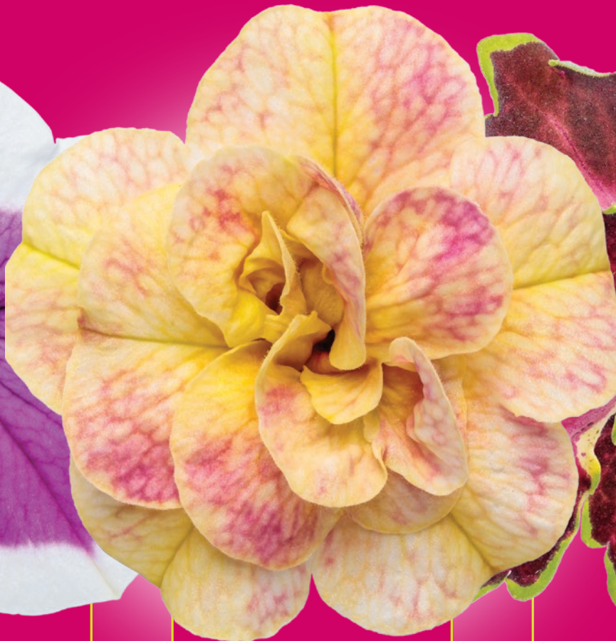
Superbells® series Calibrachoa