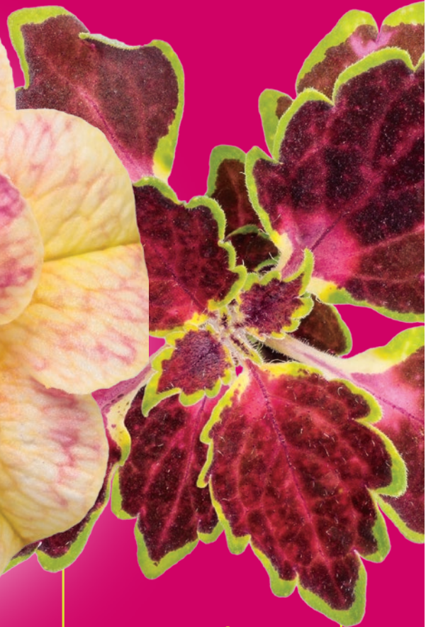
ColorBlaze® series Coleus