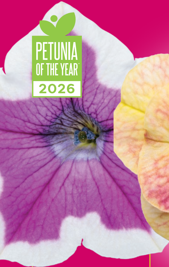
Supertunia® series Petunia