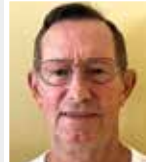
Drag Yarbro West TN Liaison