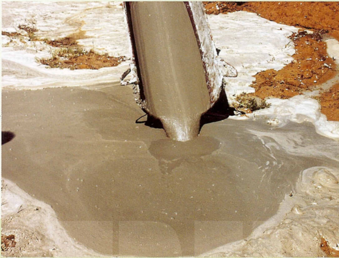
Figure 1. Fluid Consistency of the River Sand ESFF Mixture at the Algood, Tennessee Demonstration 9/23/02.