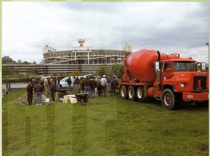
Figure 2. Knoxville ESFF Demonstration at Rinker Materials 11/01/02