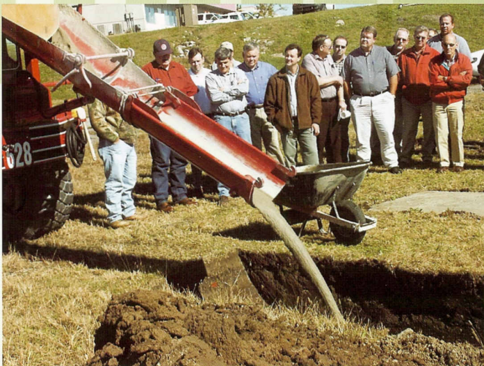
Figure 3. Nashville ESFF Demonstration at TDOT Region 3 Headquarters 11/08/02