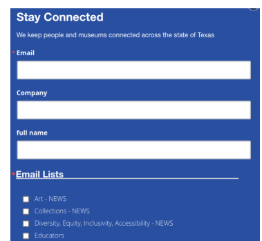
Receive curated news from TAM by selecting what type of news you'd like to receive at our homepage pop-up!