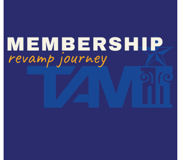
TAM will soon be releasing news about the new and enhanced membership program: Lifelong Learning with Lifelong Friends!