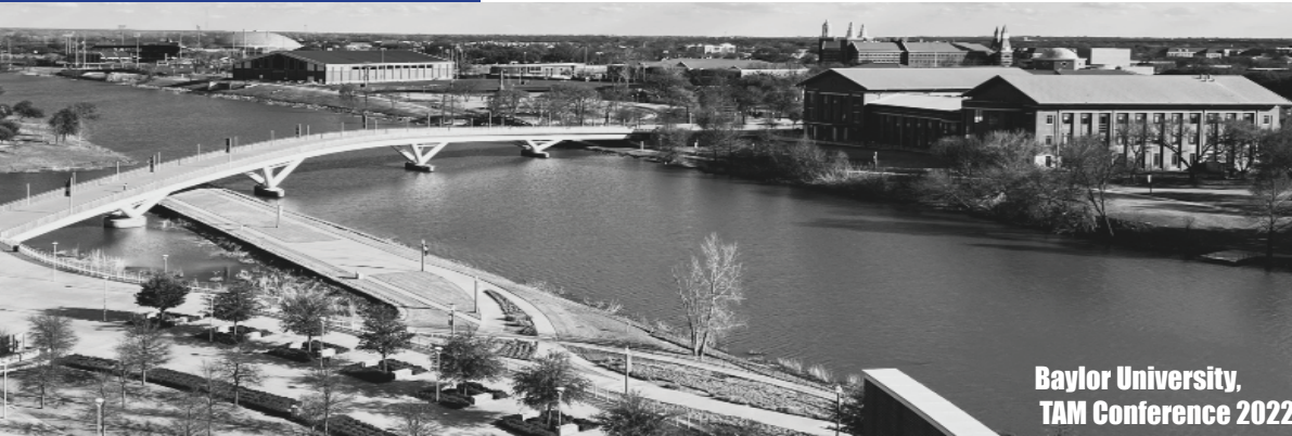
Baylor University, TAM Conference 2022