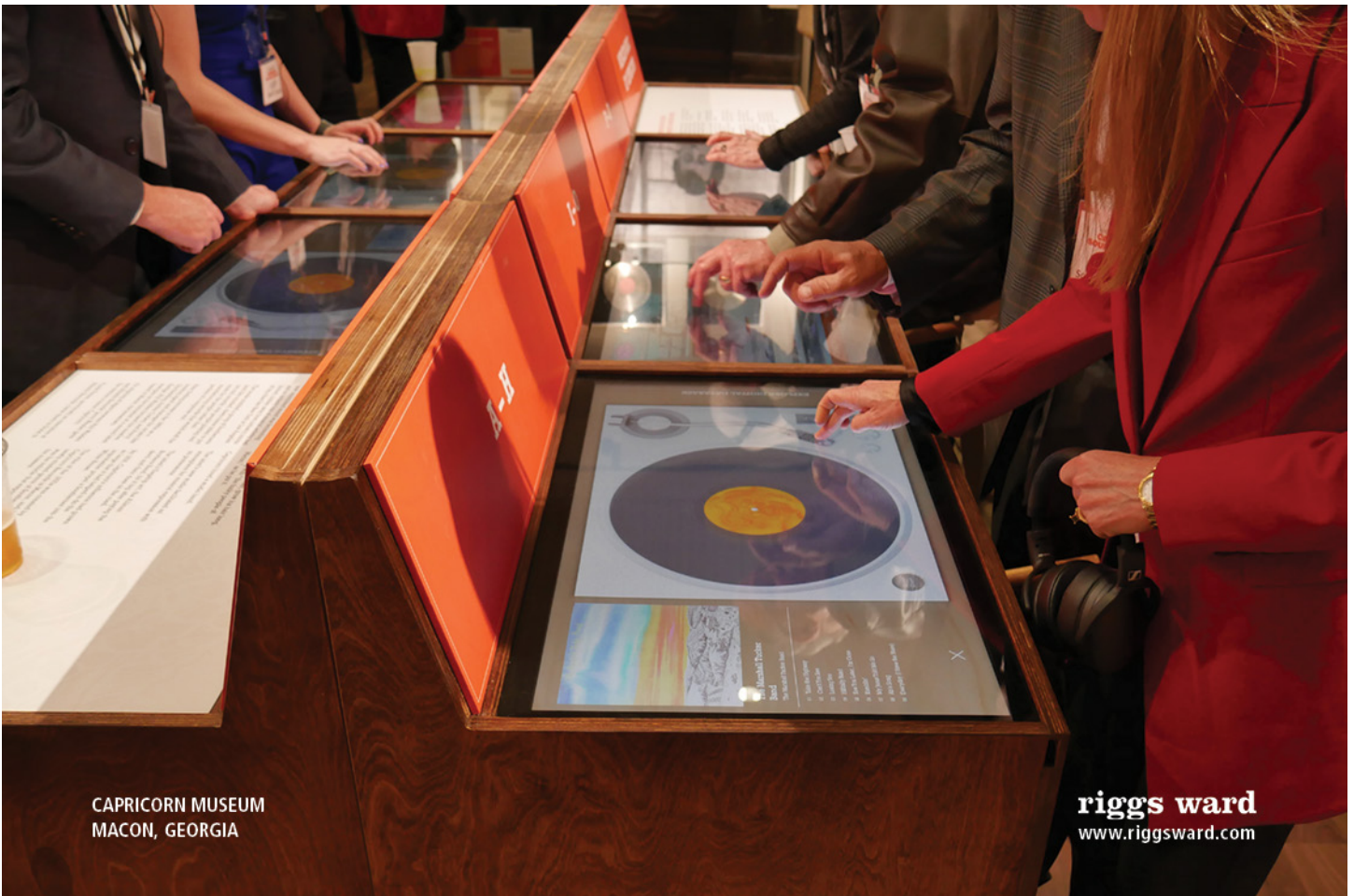
CAPRICORN MUSEUM MACON, GEORGIA