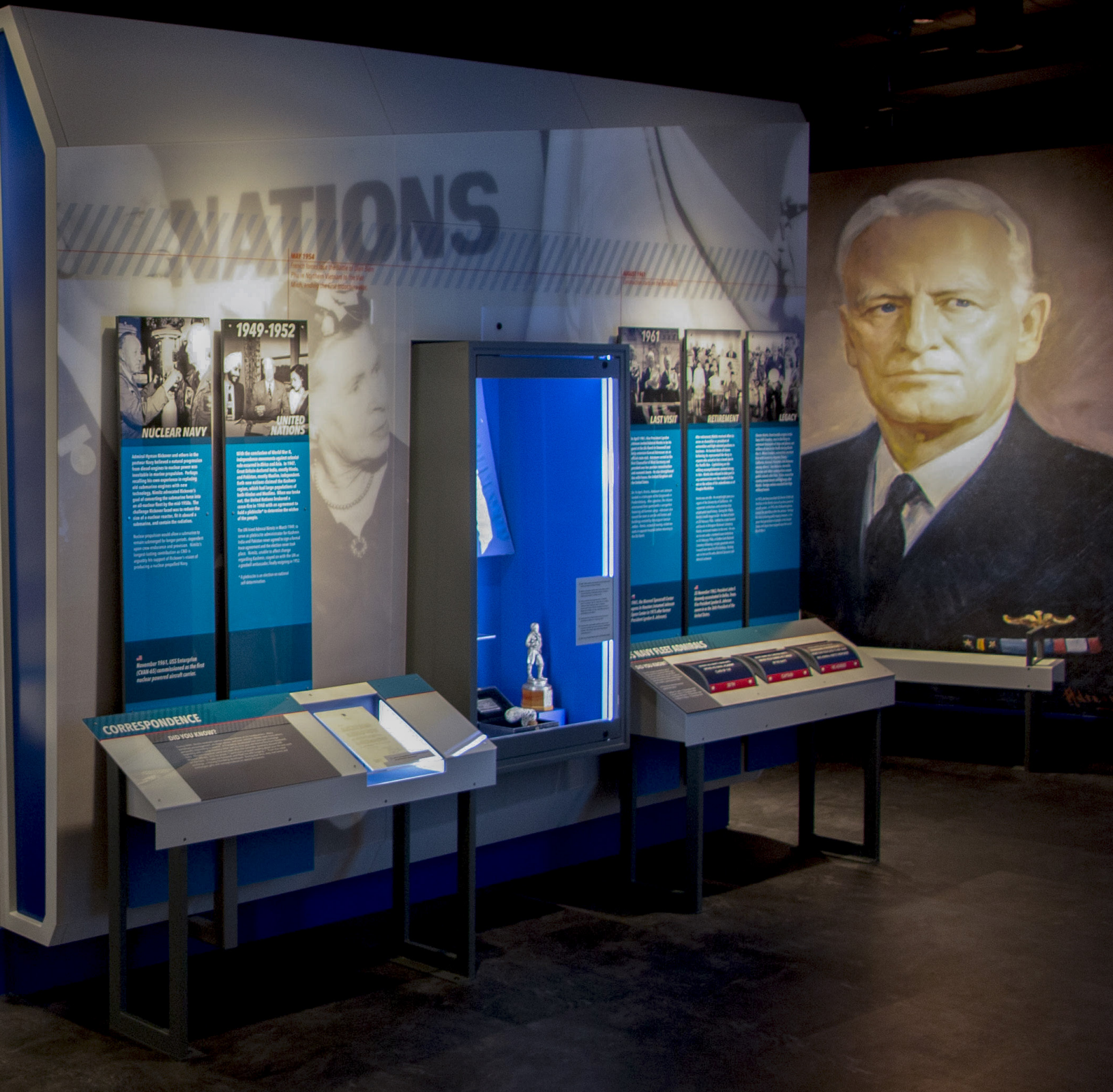
Exhibit Fabricator: Exhibit Concepts • Exhibit Designer: DIG Studios • Media Producer: BPI

ADMIRAL NIMITZ GALLERY NATIONAL MUSEUM OF THE PACIFIC WAR