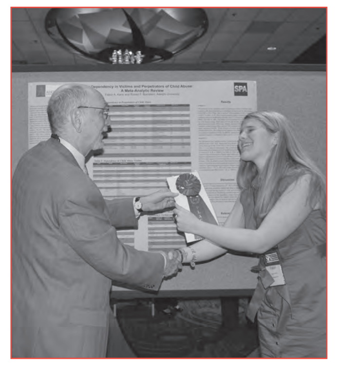
First Place Poster Session (Thursday) presentation.