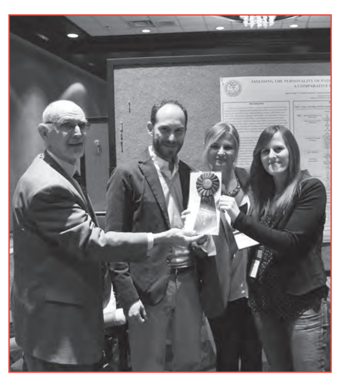
First Place Poster Session (Saturday) presentation.