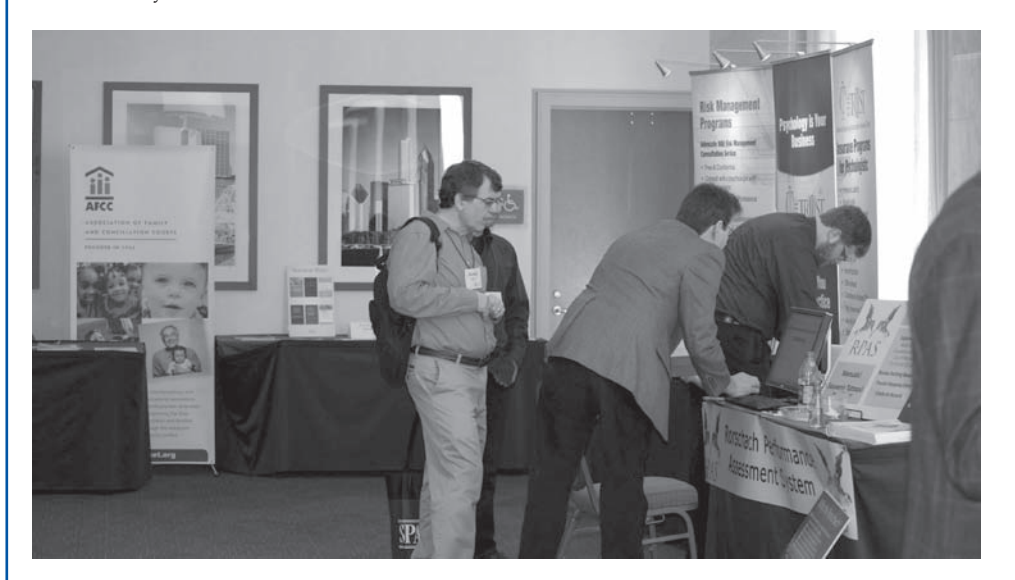
AFCC and R-PAS, SPA Annual Meeting, 2012.