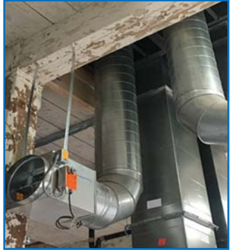
Fire smoke damper installed on 2nd floor.