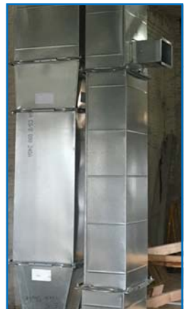
2nd floor exhaust risers