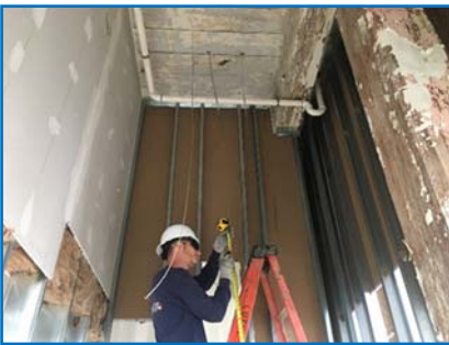
Austin Cale laying out supply duct in three-bedroom unit.