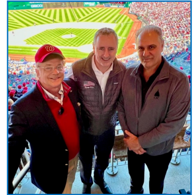
Stan Kolbe, SMACNA, Congressman Brian Fitzpatrick and Dominic Bonitatis

Congress Takes on Substance Abuse in the Workforce – Bills have been introduced in both chambers of the U.S. Congress to assist workers suffering from substance abuse. The Senate Bill (S.644), dubbed the Modernizing Opioid Treatment Access Act (MOTA) has bipartisan support and is sponsored by Ed Markey (D-MA) and Rand Paul (R-KY). It would reform outdated regulations governing the prescription and dispensing of medications used in treatment and recovery from opioid use. The House Bill (H.R. 1359), also has bipartisan support led by sponsors Donald Norcross (D-NJ) and Don Bacon (R-NE). It is co-sponsored by two other House members from the Delaware Valley – Brian Fitzpatrick (R-PA) and Andy Kim (D-NJ). Construction workers are at greater risk of opioid dependency and overdose due in part to higher-than-average injury rates and the use of opioids to treat and manage pain. Both bills are awaiting hearings and have the support of SMACNA and its chapters.