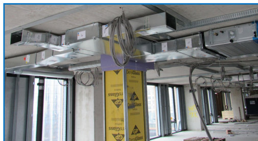
Heat pump system in the 15 th floor apartment unit.