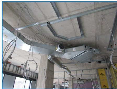
Heat pump system on 3rd floor.