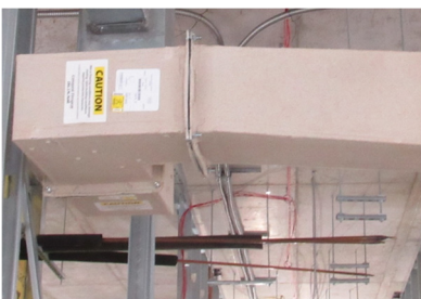
Special coated ductwork supplied by Conquest Firespray.