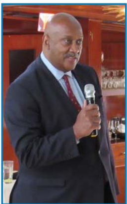
Congressman Dwight Evans

The evening was a success as contractors were able to reconnect with industry colleagues and the politicians who represent them in Washington for the first time in over a year. With COVID-19 restrictions loosening in the area, SMCA is planning for return to our traditional calendar of live events this year. We hope to see you soon!