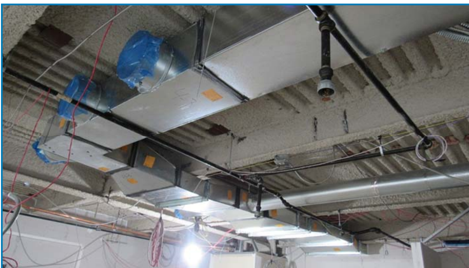
4th floor square and round duct installed.