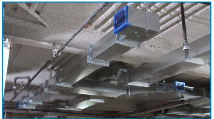
3rd Floor duct installed.