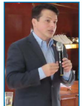
Congressman Brendan Boyle