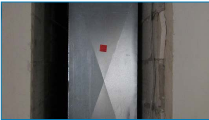
New shaft duct in a vacant shaft on the 4th floor.

Hunter Mechanical. Inc looks forward to closing out another successful project and leaving their mark at another historic building in Philadelphia while working alongside their contracted firm from Maryland, James G. Davis Construction.