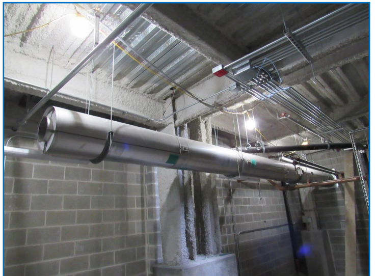
Breaching for the building.