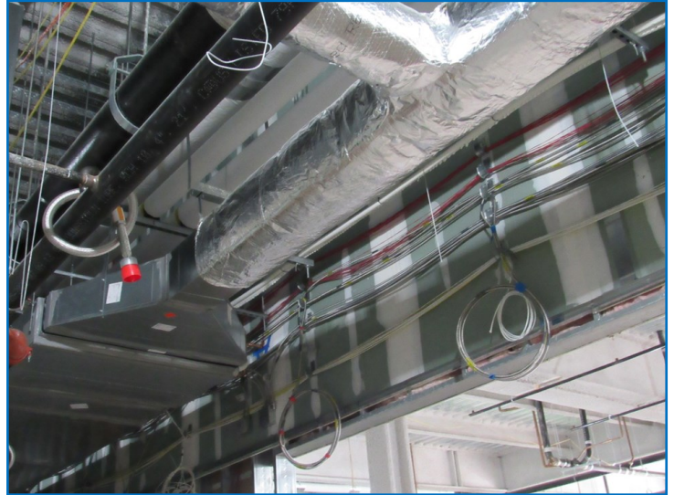
VAV boxes on ground floor.