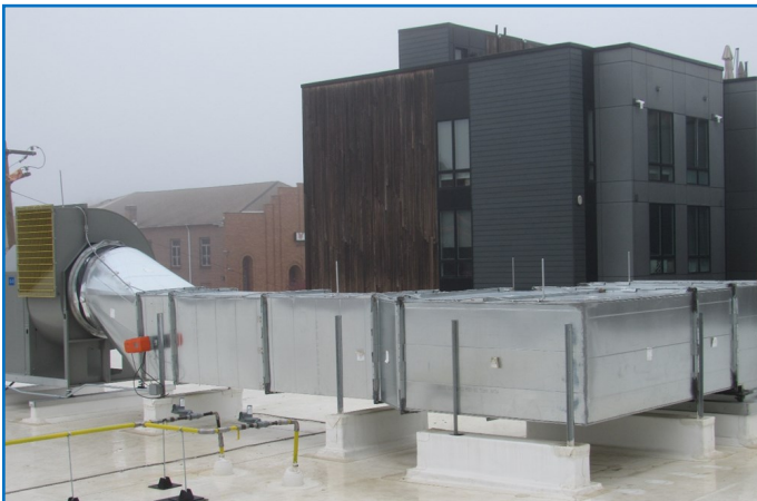
Exhaust duct for parking garage.