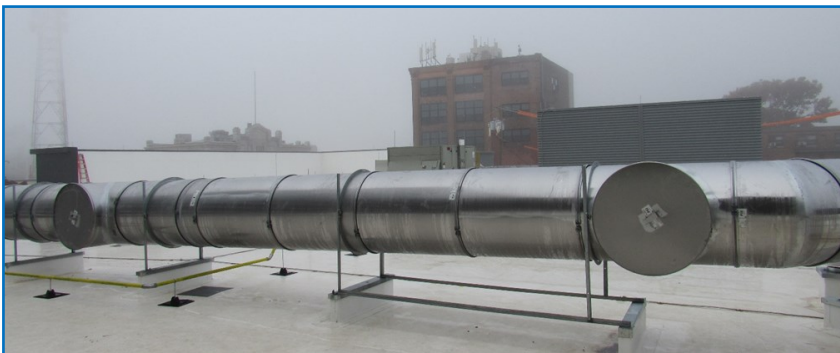
36-inch ID Triple Wall duct for grocery store.