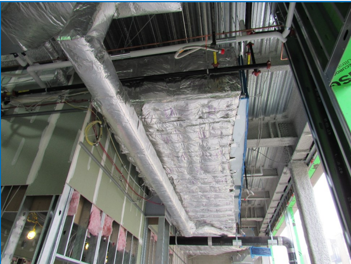
Fresh air units for parking garage and basement.