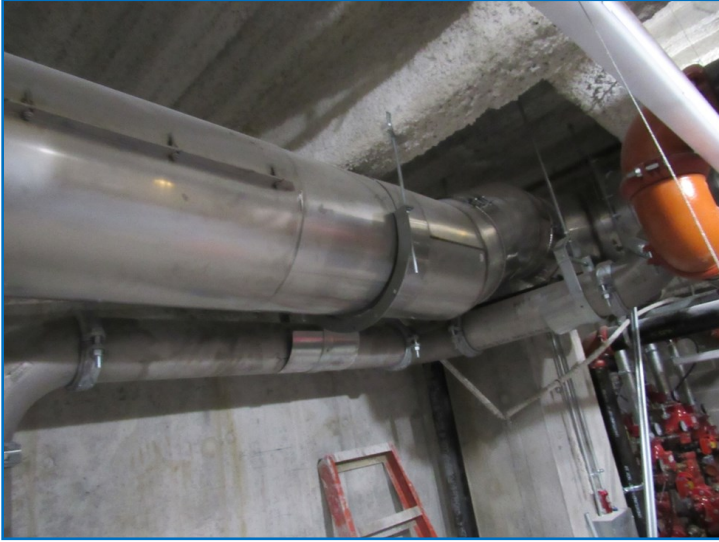
Breaching for sprinkler system.