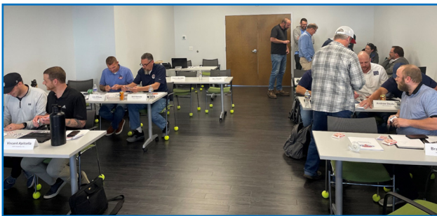
Attendees working on House of Cards exercise. Attendees were divided into General Contractors and Subcontractor groups.

house, while the General Contractors purchased base boxes from Subcontractors to build a house of cards based on the owners specifications. The cards and tape needed to be purchased(deck of assorted cards = $2,000 per deck; tape = $1,000 per roll) Subcontractors were responsible for the billing and collecting for each base box and determining a billing schedule with the customer, while General Contractors paid full price ($2,000) for a base box or negotiated a price based on the design and quality.