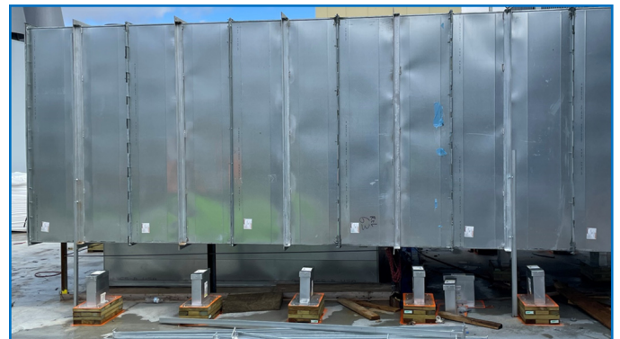
Riser Plenum unit installed on roof.