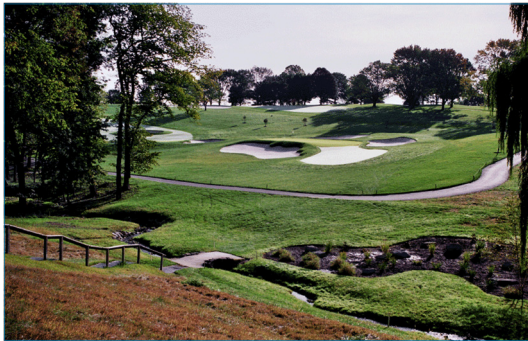
Look for the invitation over the summer!