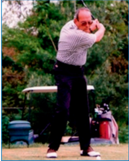
SMCA Golf Outing