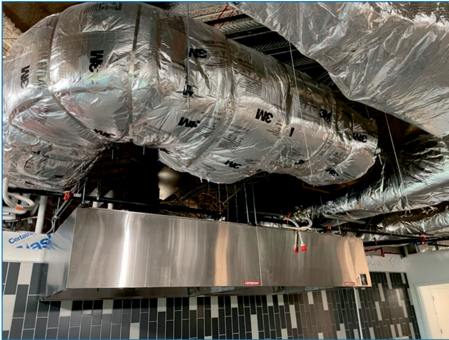
Kitchen hood in third floor dining service room.