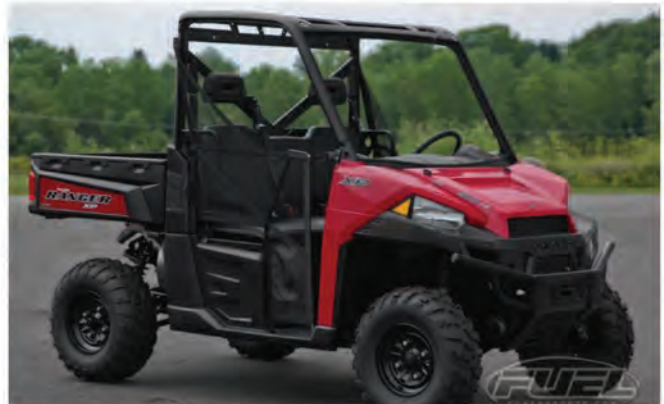
Polaris Ranger 900 EPS

If sales quota is not met, SDMHA will refund ticket prices