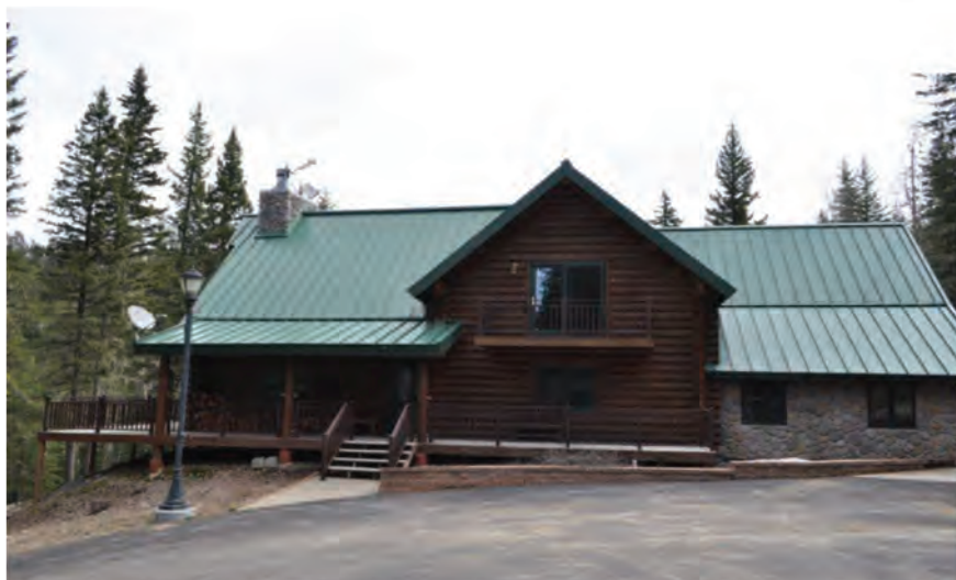
5 Day/4 Night Stay at: Bear Butte Gulch Lodge, near Deadwood