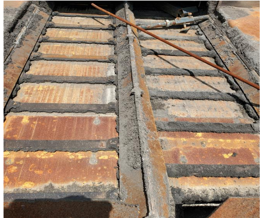
Guards Exposing Chains