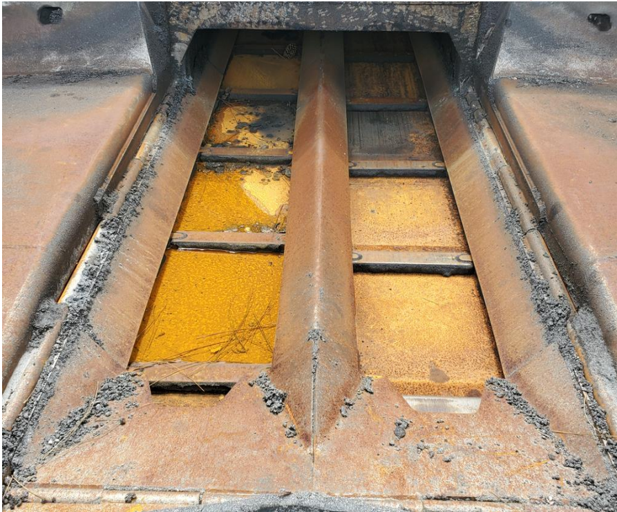
Center Guard Covering Chains

Slat Bars, Bolt Size, Guard Thickness, All Plates