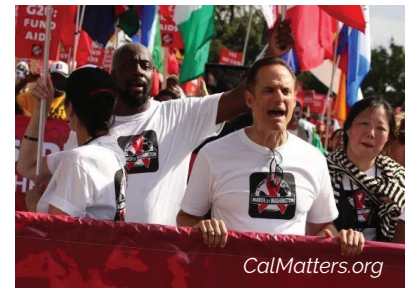
AIDS Healthcare Foundation Rent Control Proponents

With the 2020 election only 11 months away, interest groups have been active in their efforts to collect signatures to qualify a number of different initiatives for the ballot. Of specific interest is the proposed rent control initiative led by the AIDS Healthcare Foundation which is currently only polling at around 40% in favor. The proponents recently submitted signatures to qualify the measure for the ballot. The next step is ensuring that there are enough valid signatures to qualify it. The measure needs over 600,000 valid signatures to qualify. Other efforts of interest are those that intend to raise taxes, or change Proposition 13 to create a split roll structure in order to raise money for education. This month, the initiative that was led by the California School Boards Association was dropped. This initiative would have raised personal and corporate taxes to raise money for schools. A split roll initiative, which would remove commercial properties from the protections of Proposition 13 will appear on the ballot in 2020.