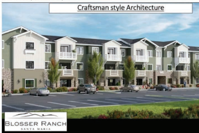
Image: One of the new apartment projects proposed for Santa Maria would use craftsman-style architecture. The project would be built near the intersection of Blosser Road and Western Avenue.

The entire Blosser Ranch development is expected to be completed by 2030.