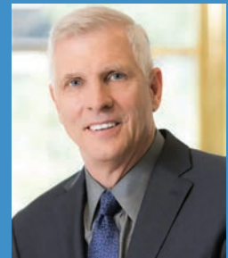
CA Senator Tom Umberg

Senator Monique Limón (D-Santa Barbara) will serve on the following committees: