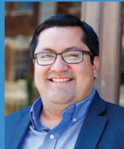
CA Senator Jesse Arreguin