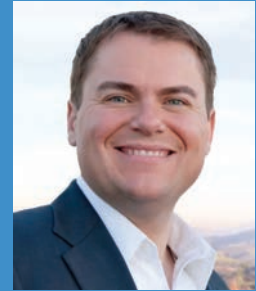
CA Assemblymember Carl DeMaio