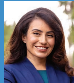
CA Senator Sasha Renée Pérez

The Legislative calendar for the year is as follows: