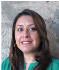
CA Assemblyperson Luz Rivas

Credit History of Persons Receiving Government Rent Subsidies. Would require housing providers to consider alternative evidence in lieu of the person's credit history in determining rental accommodations.