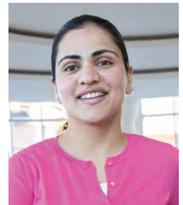
CA Senator Aisha Wahab

Statewide eviction database. Would state the intent of the Legislature to enact subsequent legislation that would require landlords to report all evictions to a new statewide eviction reporting database.