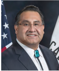
CA Assemblyperson James Ramos

Current law prohibits a local agency from requiring an accessory dwelling unit to provide fire sprinklers, if they are not required for the primary residence. This bill would prohibit a local agency from imposing or enforcing any requirement to provide fire sprinklers for any dwelling with a total floor area of less than 500 square feet.