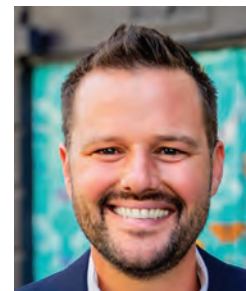
CA Assemblyperson Matt Haney

Tenancy: Security Deposits. Would prohibit a landlord from receiving a security deposit for a rental agreement in an amount in excess of one month's rent, regardless of whether the residential property is unfurnished or furnished.