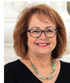
CA Senator Maria Elena Durazo

Tenancy. Spot bill that is intended to change the statute for no-fault just cause evictions, expand the population of protected tenants, and lower the annual rent cap.