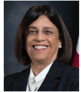
CA Assemblyperson C. Aguilar-Curry

Lowering of Voter Threshold. Local government financing: affordable housing and public infrastructure: voter approval. Would lower the necessary voter threshold from a two-thirds supermajority to 55 percent to approve local general obligation (GO) bonds and special taxes for affordable housing and public infrastructure projects.