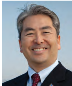
CA Assemblyperson Al Muratsuchi

Mobile Home Parks Rent Caps. Would prohibit the management of a mobile home park from increasing the gross rental rate for a tenancy for a mobile home space more than 3% plus the percentage change in the cost of living, as defined, over the course of any 12-month period, as specified.