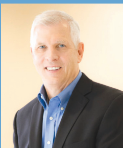
Senator Tom Umberg