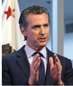
Governor Gavin Newsom

Sacramento, CA - The California Rental Housing Association (CalRHA) applauds Governor Newsom for including funding for rental housing emergency assistance and the Behavioral Health Bridge Housing Program in the state budget.