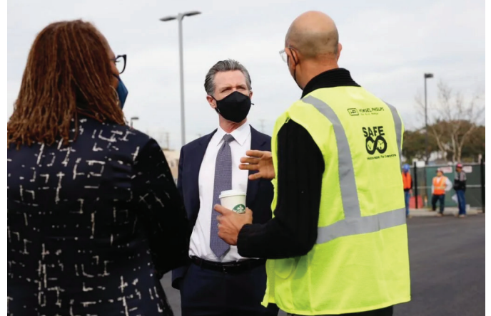
1/31/2023. Governor Newsom visits behavioral health and transitional housing facility in Los Angeles County, a new facility that will offer housing and medical services to people transitioning out of homelessness.

We look forward to working with Governor and the Legislature to ensure that these programs are implemented in a way that is effective and efficient, maximizing the number of Californians who are housed.