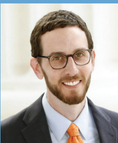
Senator Scott Wiener

In the Senate, the Housing and Judiciary Chairs remain the same with Scott Wiener and Tom Umberg, respectively. The full list of Senate committees may be found https://docs.google.com/document/d/13h20Qqo-VAkgqbLsR .