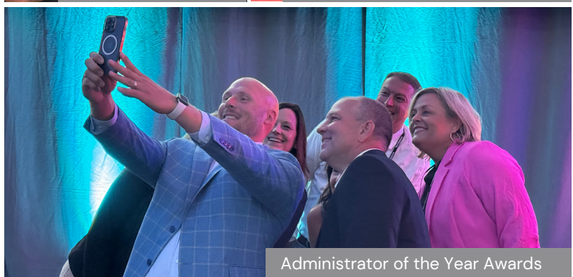
Administrator of the Year Awards