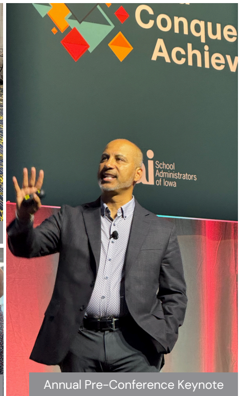
Annual Pre-Conference Keynote