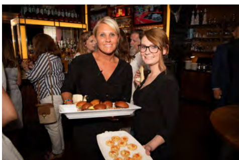
The Capital Grille Team