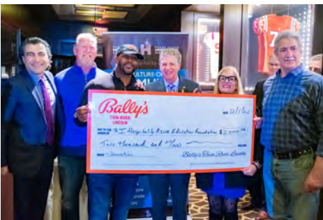
RIHA receives a check from Bally's Twin River Lincoln in support of the RI Hospitality Education Foundation