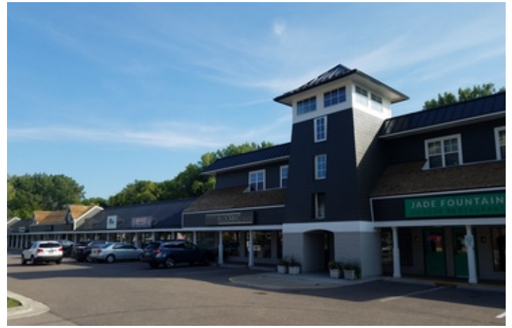
Design & Aesthetics Renovation/Remodel: Exterior Retail over 20,000 SF The Village ~ Wayzata