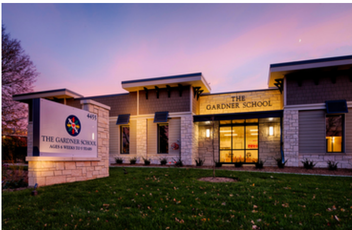
Redevelopment: Retail over 10,000 SF The Gardner School ~ Edina