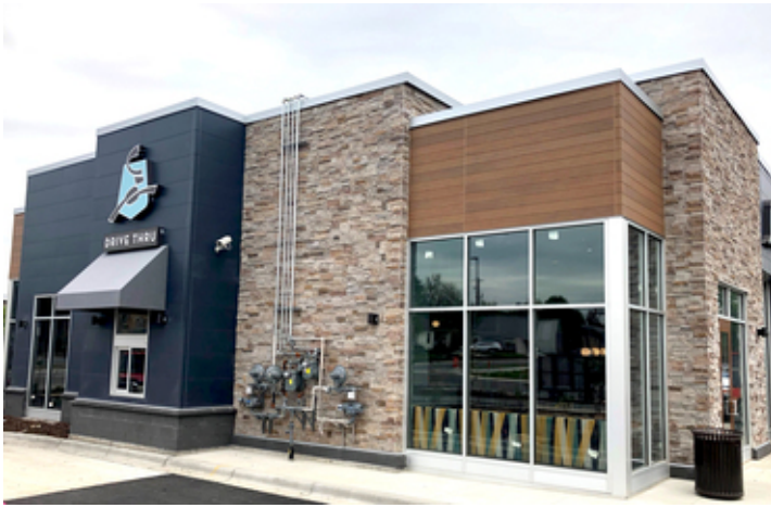
New Construction: Retail 10,000 – 25,000 SF Plaza 66 ~ Richfield