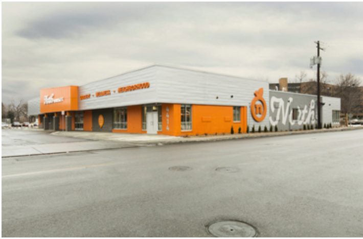
Design & Aesthetics Renovation/Remodel: Exterior Retail under 20,000 SF North Market ~ Minneapolis