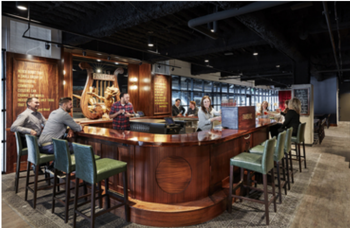
Interior Design: Retail/Non-Food Service Finnegans ~ Minneapolis