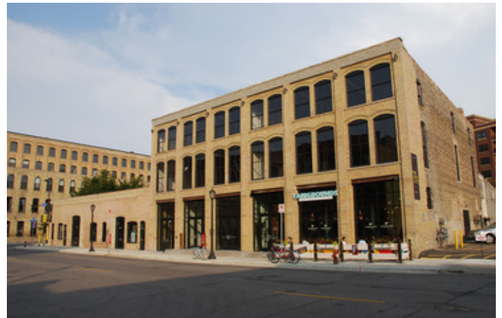
Redevelopment: Retail under 10,000 SF 124 North 3rd ~ Minneapolis