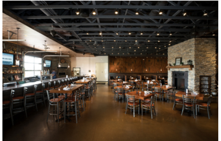
New Construction: Retail under 10,000 SF Chow Mixed Grill & BBQ ~ Elk River