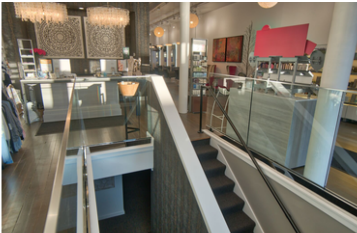
Design & Aesthetics Renovation/Remodel: Interior Retail under 5,000 SF Sanctuary Salonspa ~ Excelsior