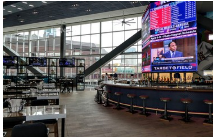
Design & Aesthetics Renovation/Remodel: Interior Retail 5,000 – 15,000 SF Bat & Barrel ~ Minneapolis