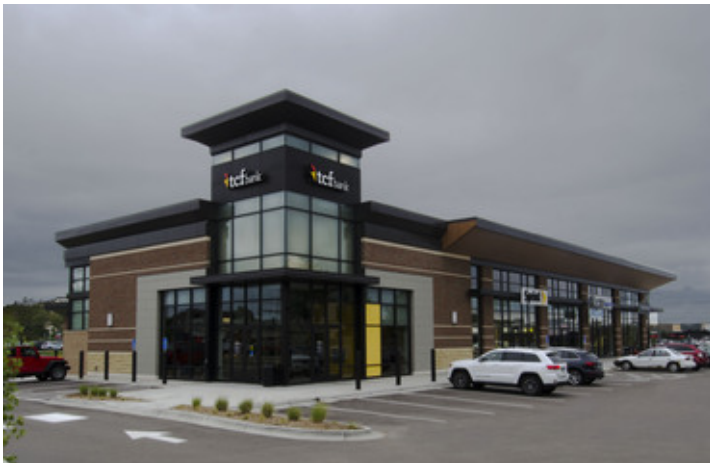
Development Process Ridgedale Corner Shoppes ~ Minnetonka