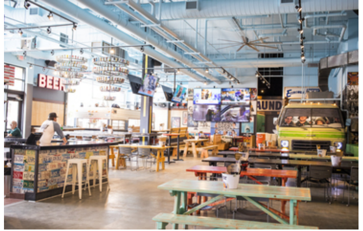
Interior Design: Quick Service/Fast Casual/Fast Food 7th Street Truck Park ~ St. Paul