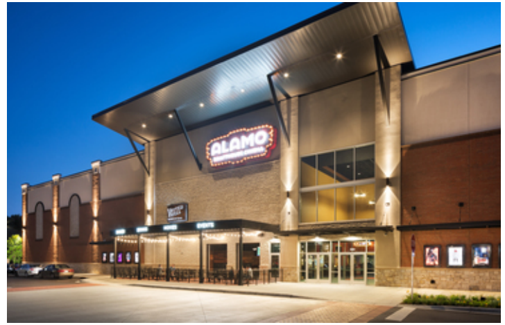
New Construction: Retail over 25,000 SF Alamo Drafthouse Cinema - Woodbury Lakes ~ Woodbury