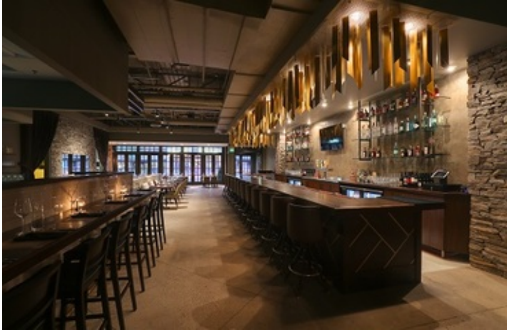
Interior Design: Full Service Restaurant Moderna Kouzina ~ Edina