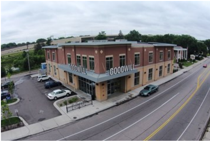
New Construction: Retail over 20,000 SF Goodwill - Minneapolis