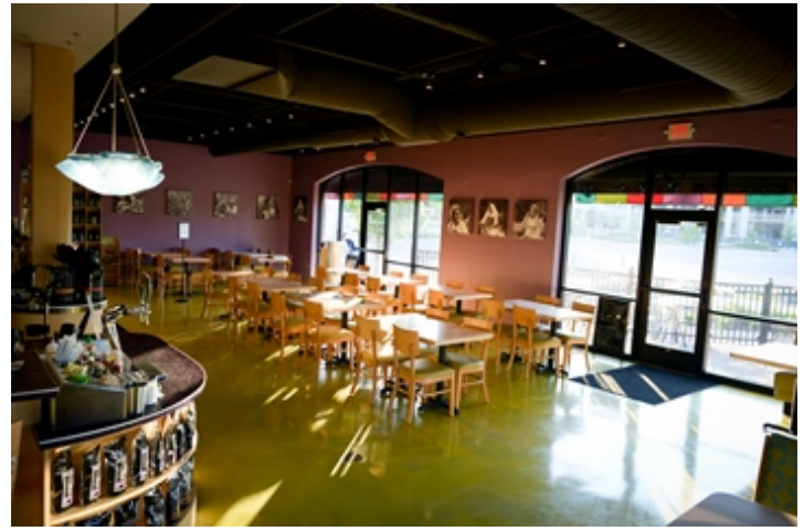
Design & Aesthetics Renovation/Remodel: Interior Retail under 5,000 SF Peoples Organic