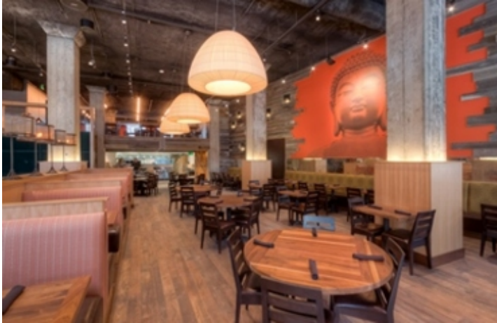
Interior Design: Restaurant/Food Service Ling & Louie's Asian Bar & Grill