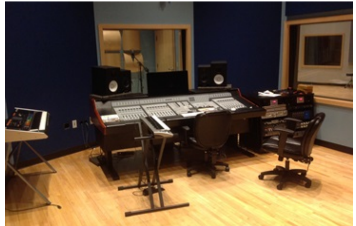
Design & Aesthetics Renovation/Remodel: Interior Retail over 15,000 SF University Center