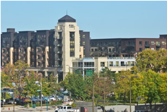
Mixed Use 222 Hennepin