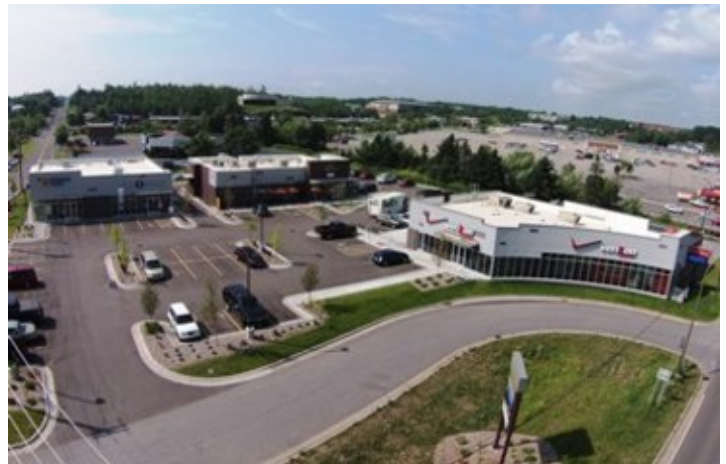
New Construction: Retail 10,000 – 20,000 SF Hansen Center - Duluth