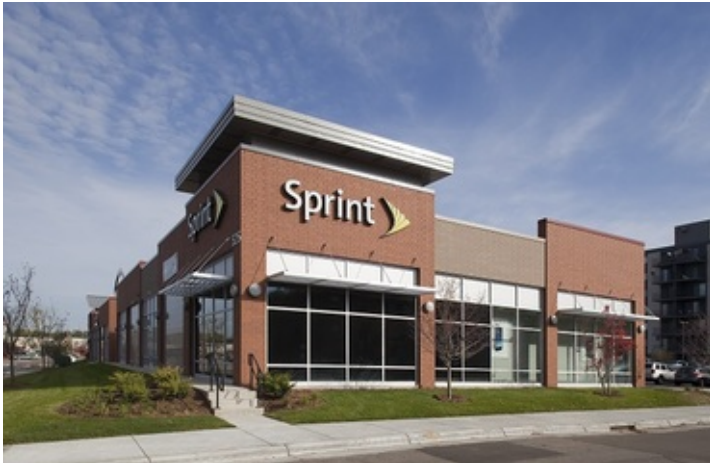
Development Process Knollwood Crossings