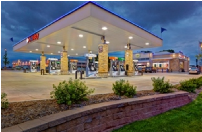
New Construction: Retail under 10,000 SF Holiday Stationstore Metropolitan Airport Commission