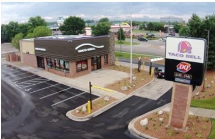
Design & Aesthetics Renovation/Remodel: Exterior Retail