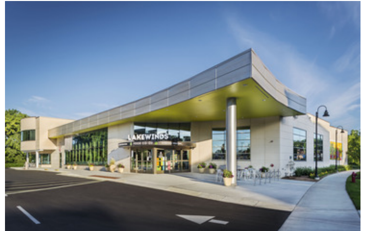
Redevelopment Lakewinds Natural Foods