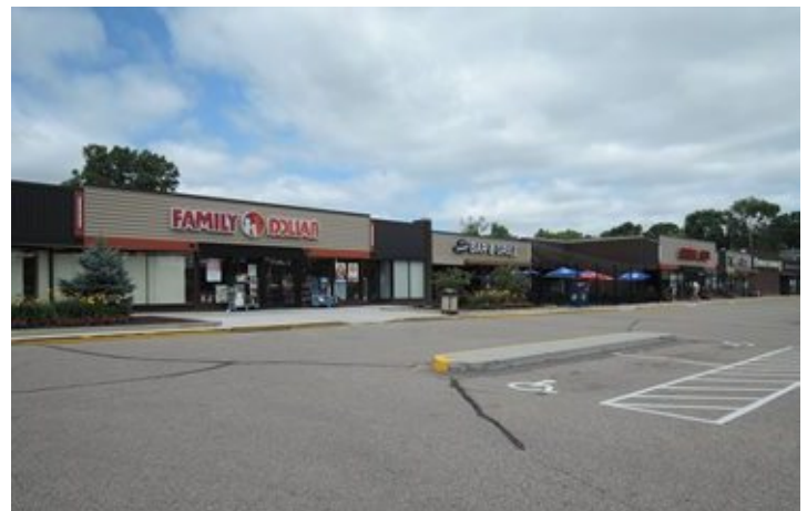
Design & Aesthetics Renovation/Remodel: Exterior Retail