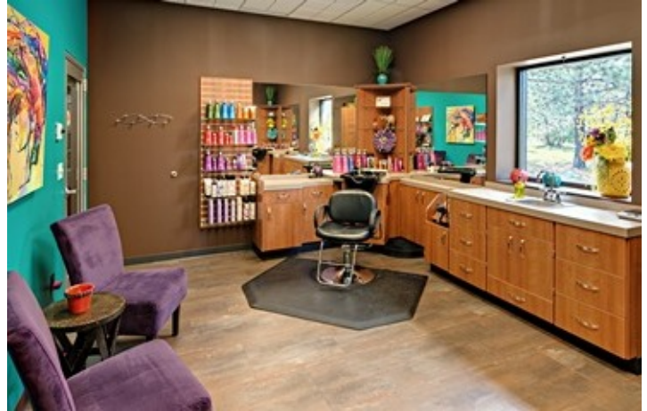
Interior Design: Retail/Non-Food Service Sola Salon Studios - Blaine