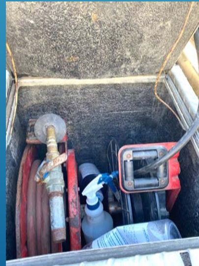
Heated and insulated fill hose box