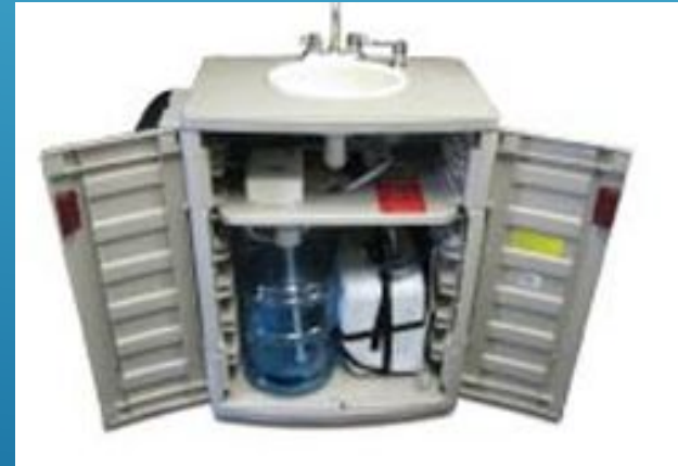
Winter Sink Option #2