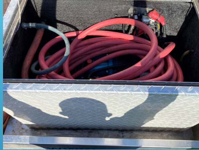
Heated & Insulated water pump box