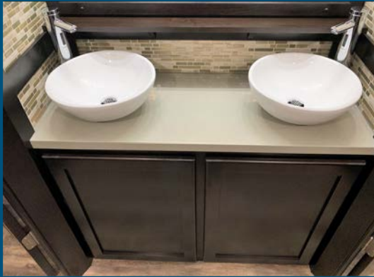
Hands Free Faucets