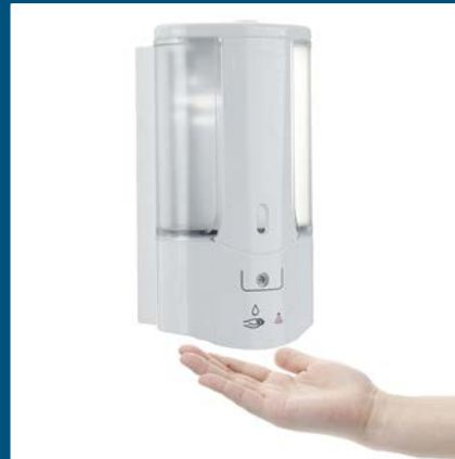
Hands Free Soap Dispensers