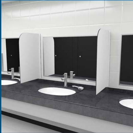
Add Sink Dividers