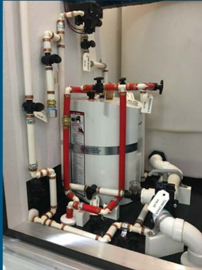
Adding Hot Water