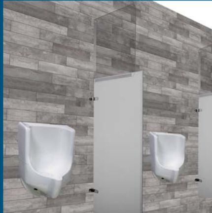
Add Additional Plexiglass Partitions