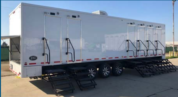
Convert to Individual Entrances