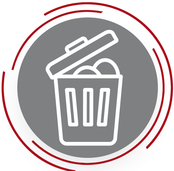
Solid Waste Disposal