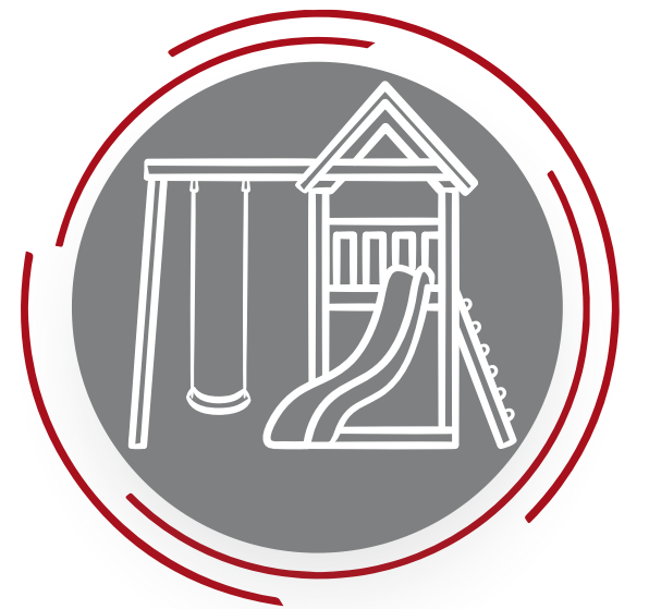
Parks & Recreation