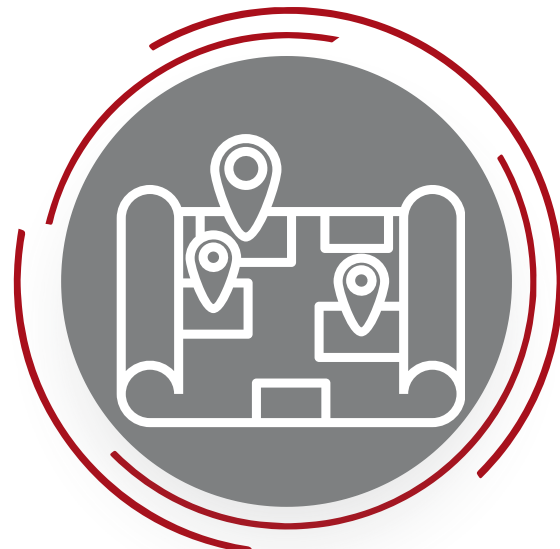
Land Use & Planning