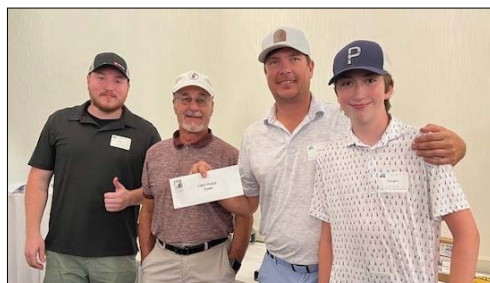
1st Place Team

Many thanks for a great 32 nd Annual Summer Outing!