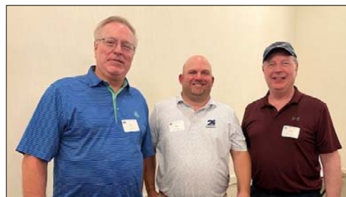
3rd Place Team

SAVE THE DATE: 33 rd ANNUAL SUMMER OUTING August 6, 2025 at Drumlin’s Country Club, Syracuse NY