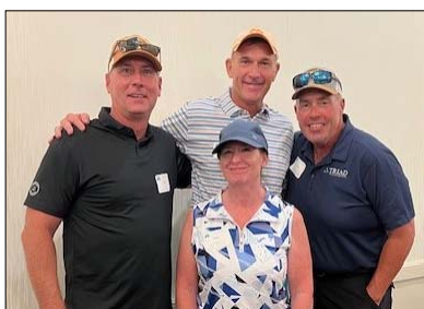
2nd Place Team