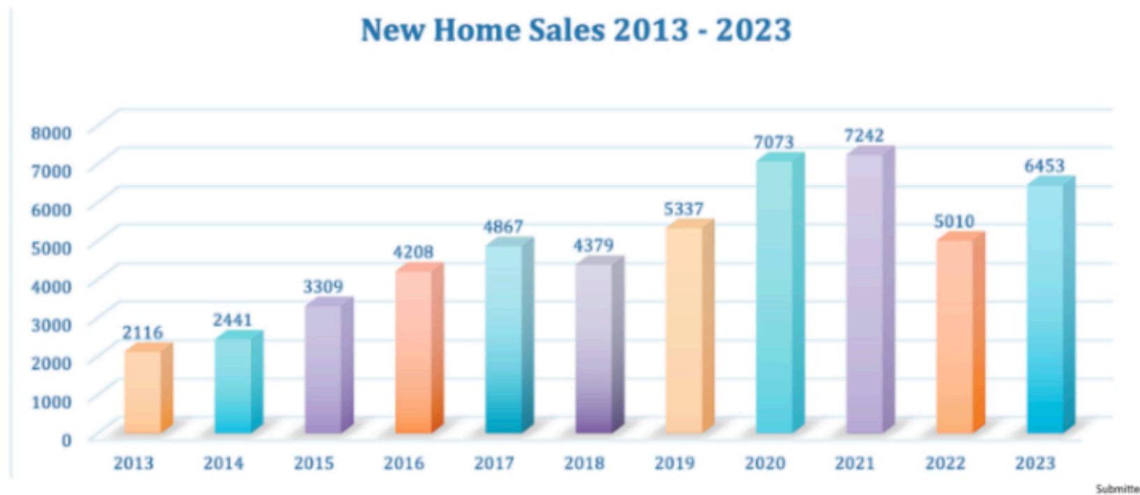
New Home Sales 2013-2023.

Thousands of homeowners who locked in home interest rates below 4% are now not interested in selling even if they would normally downsize or relocate. While rates have dipped into the mid-6% range from their peak near 8%, it is unlikely that a large number of