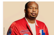
Roy Wood Jr.