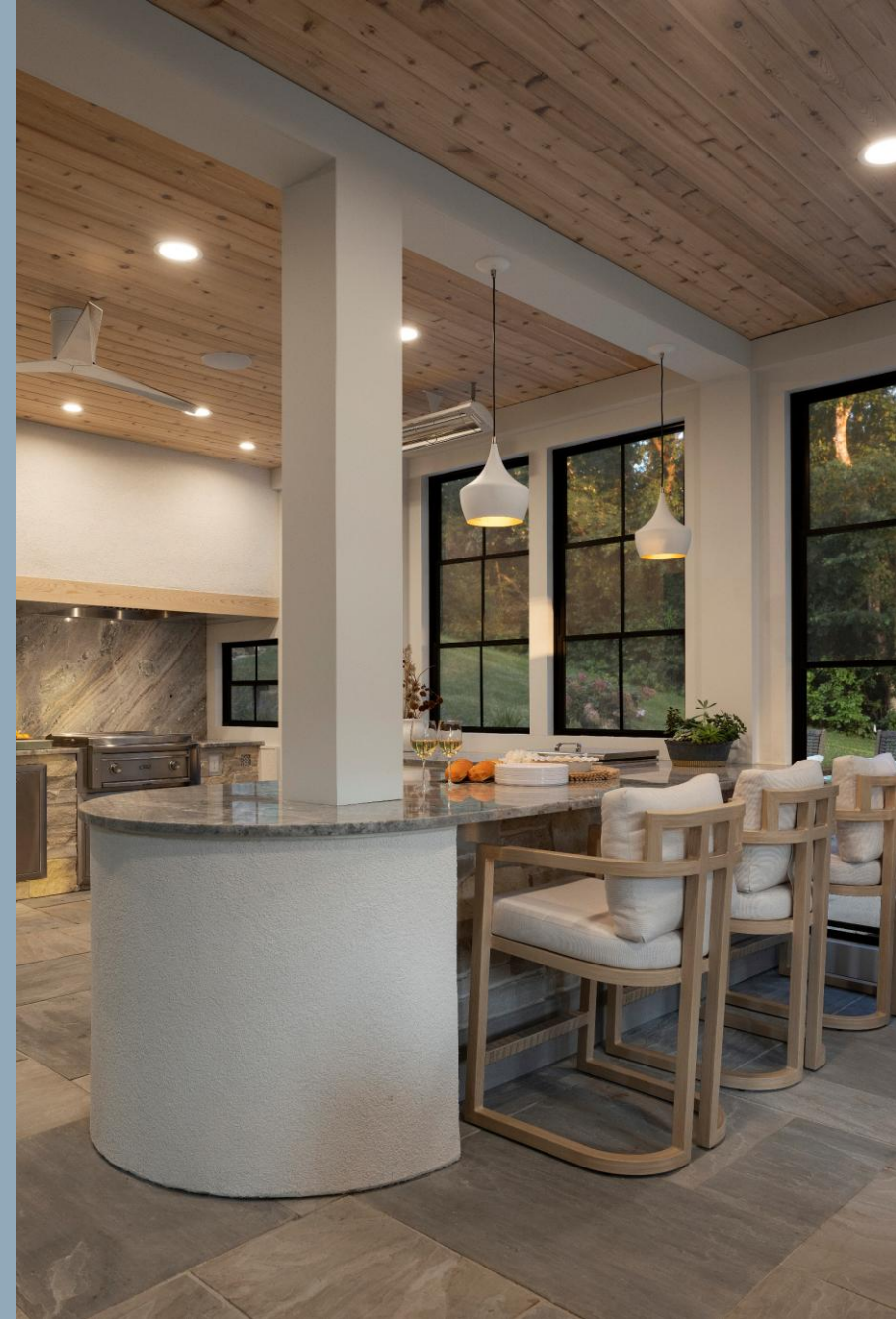
Cool California Residential Exterior Over $200,000