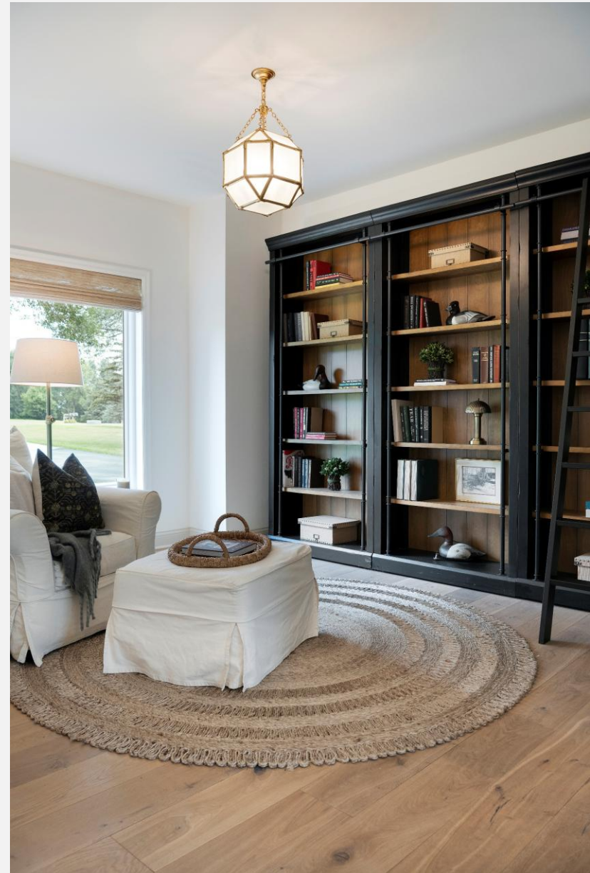
Heart of Home Residential Interior $100,000 to $250,000