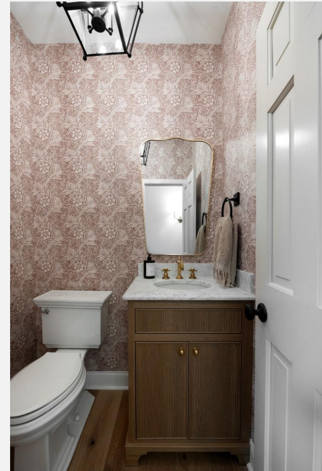
Heart of Home Residential Interior $100,000 to $250,000