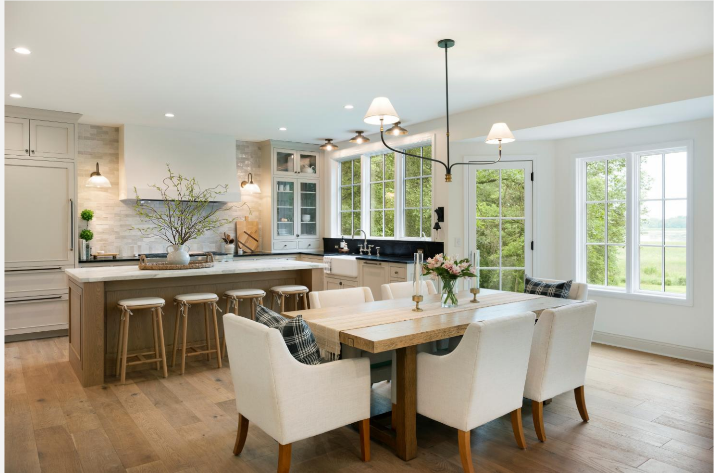
Heart of Home Residential Interior $100,000 to $250,000