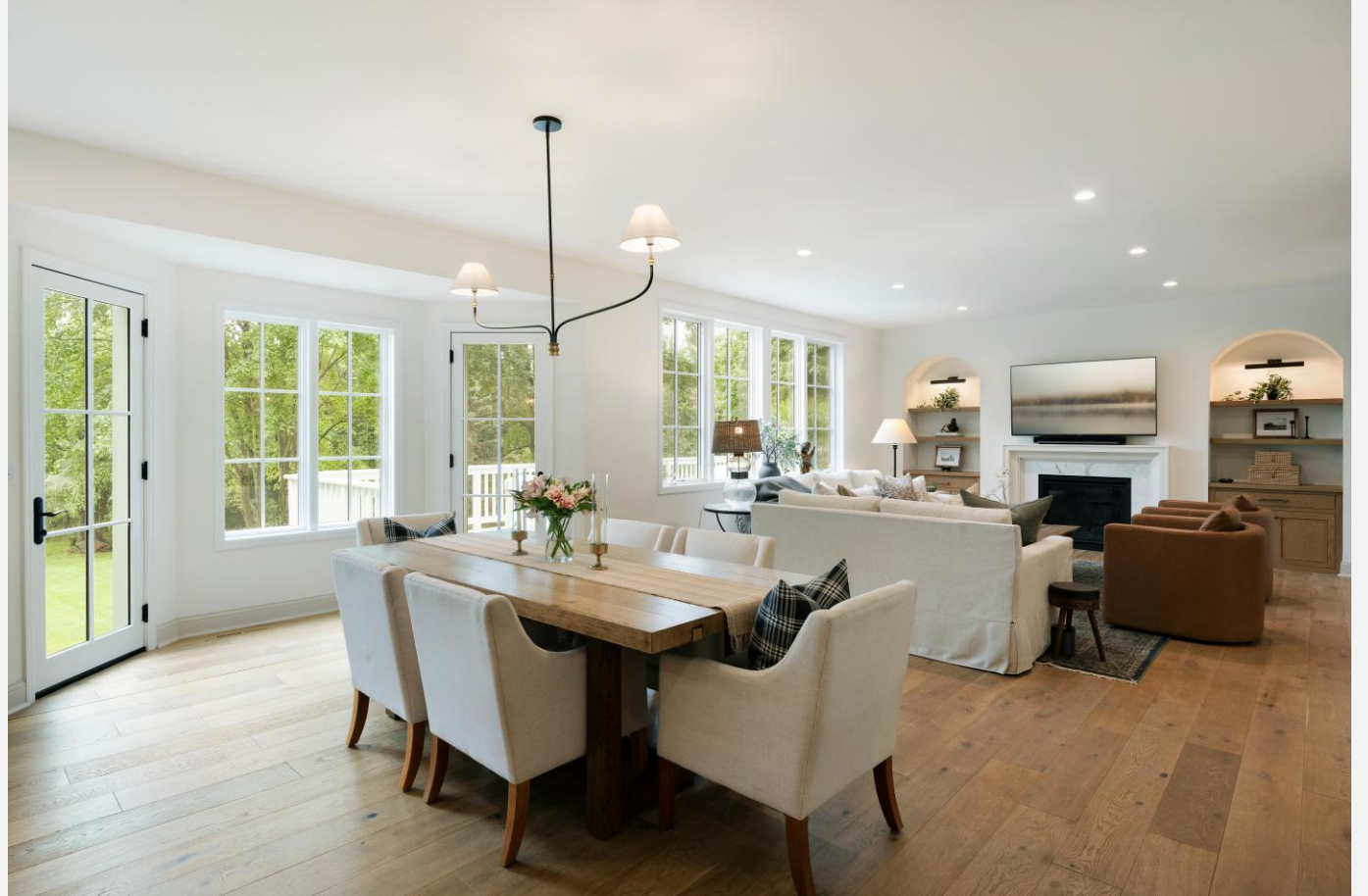
Heart of Home Residential Interior $100,000 to $250,000

It seemed as though every wall that was opened for window installation, the wet bar, and other features was packed with plumbing or HVAC lines. This required extensive planning and creative problem-solving. Thanks to skilled tradespeople, we successfully re-routed systems, utilized toe-kick vents, and maintained the design vision without compromising functionality or aesthetics.