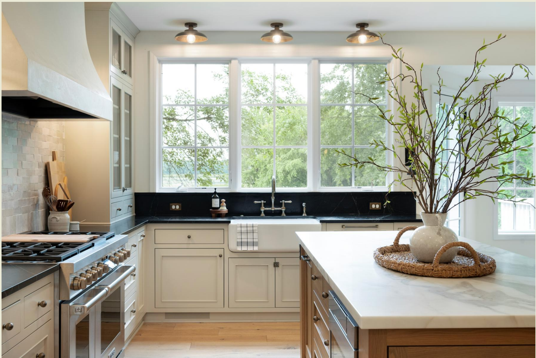
The Heart of Home Project NARI MINNESOTA - 2025 ROTY AWARDS