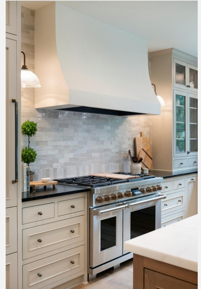
Heart of Home Residential Interior $100,000 to $250,000