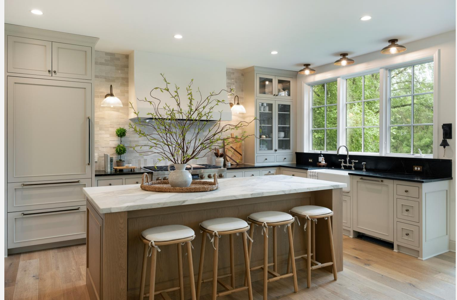
Heart of Home Residential Interior $100,000 to $250,000