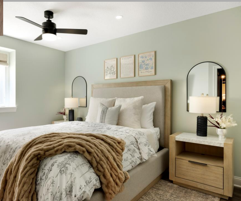
Guest Bedroom & Bath