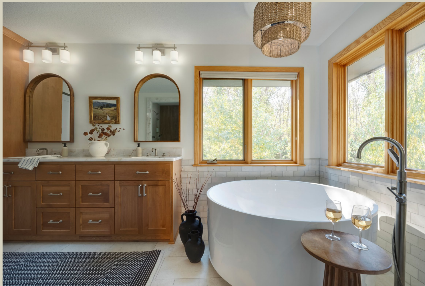
The Ember Spa Project NARI MINNESOTA - 2025 ROTY AWARDS