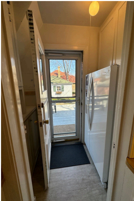
ENTIRE HOUSE OVER $1,000,000 | ROTY AWARDS