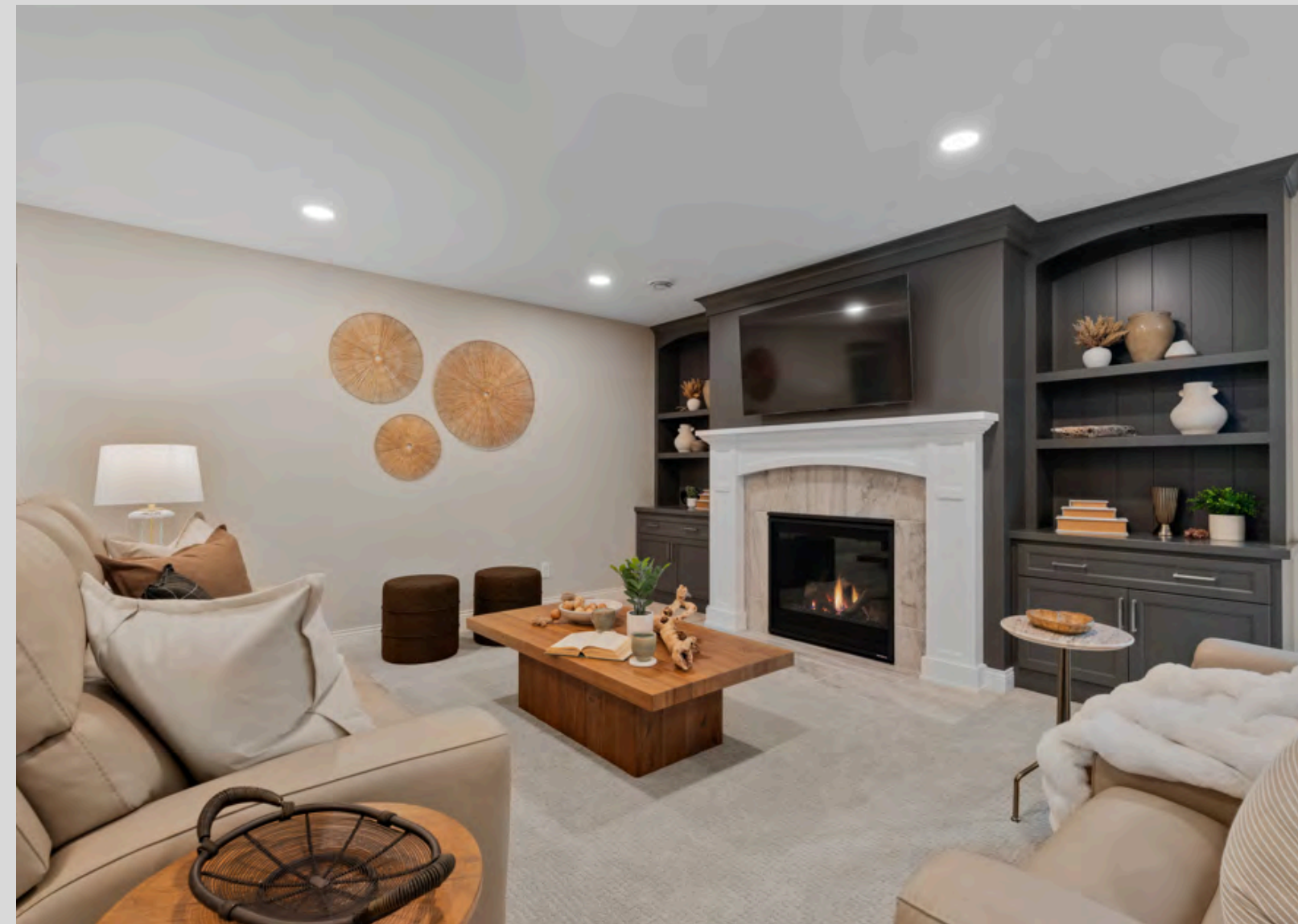
NARI - Minnesota - 2025 RotY Awards - Basement $100,000 - $250,000