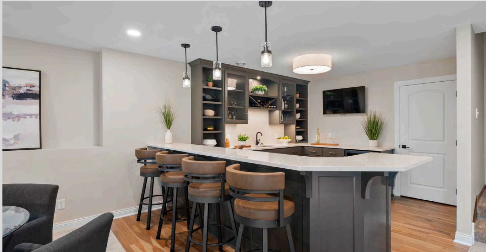
NARI - Minnesota - 2025 RotY Awards - Basement $100,000 - $250,000