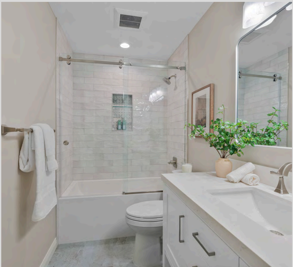
NARI - Minnesota - 2025 RotY Awards - Basement $100,000 - $250,000