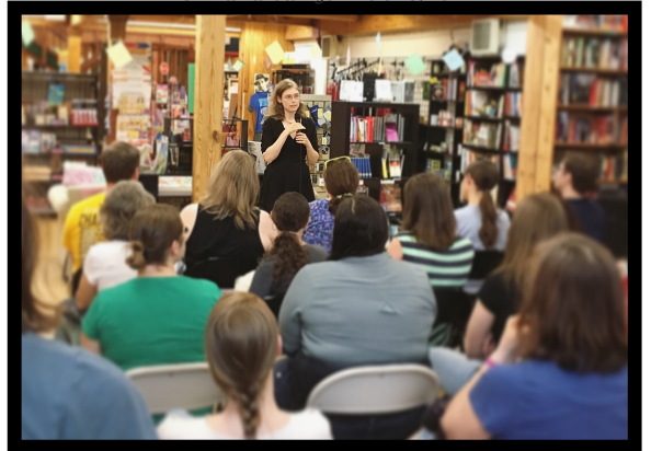
Madeline Miller, 2018