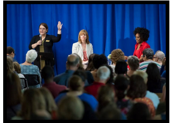
Chimamanda Ngozi Adichie, 2017