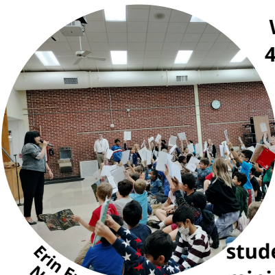
Erin Entrada Kelly November 2022

Our school author visits provide 200+ students/school with minimum buys and a signing at the store