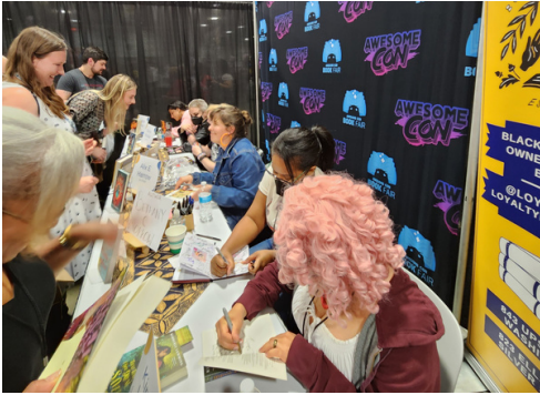
Author signings at Loyalty's Book Fair in partnership with Awesome Con