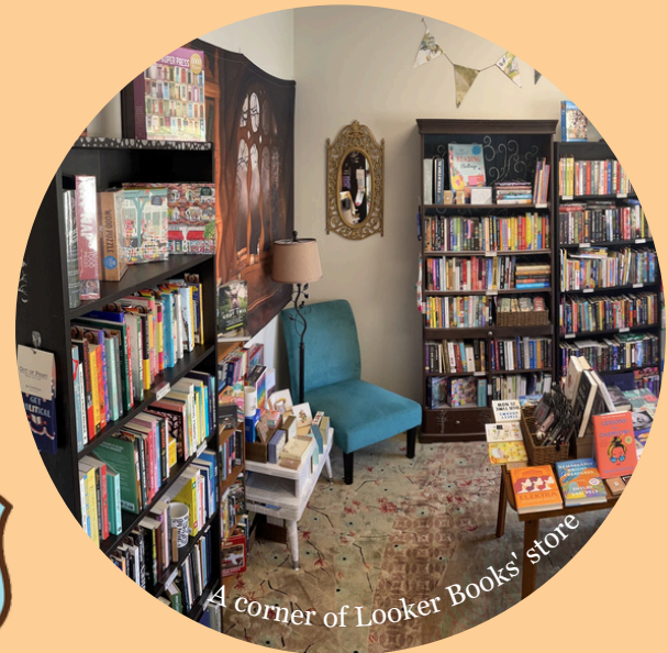
A corner of Looker Books' store

Professional Booksellers School Certifications: Basic Bookselling, Event Management, & Store Operations