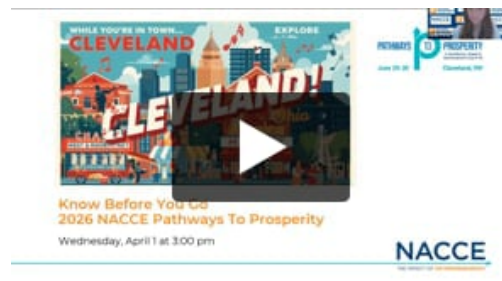
Know Before You Go Webinar Recording

Miss the Know Before You Go Webinar? Watch the recording to get helpful tips before heading to Cleveland!