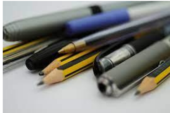
Pen or Pencil