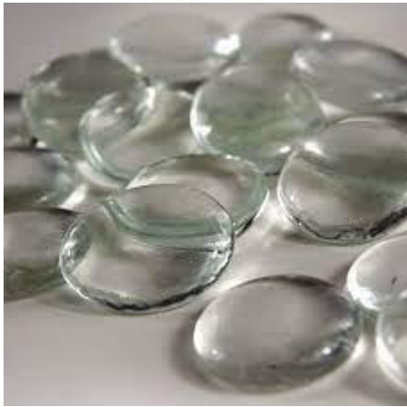
Flat Glass Marbles