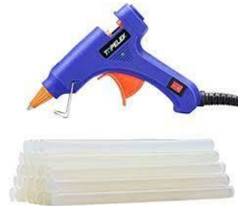
Hot Glue Gun*

*Super Glue, or another strong household adhesive may be used