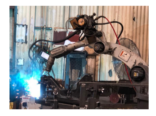
Robotic Welding Armused to train Sumner Manufacturing Inc. employees