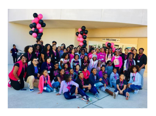
Black Girls Code Workshop@SW Campus Fall 2018