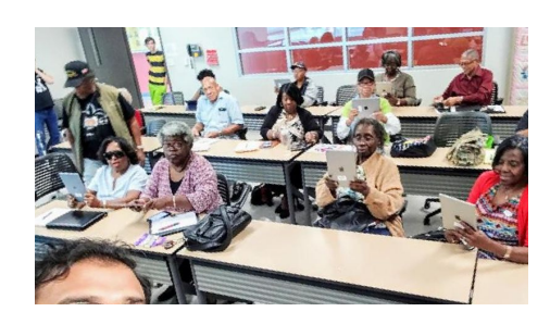
Senior Citizens Digital upSkills Workshops