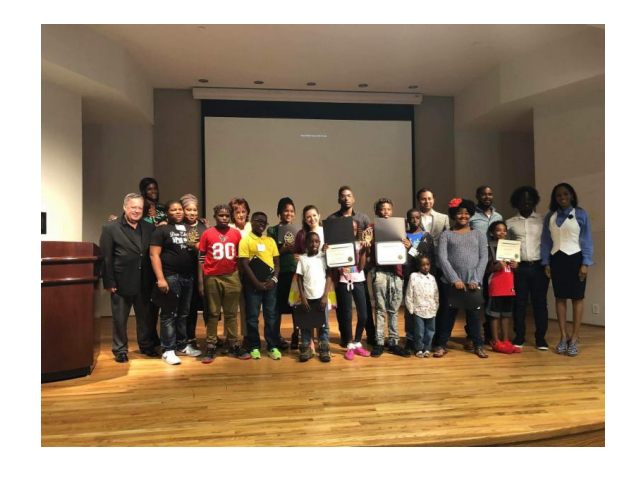
Youth Pitch Competition Fall 2018