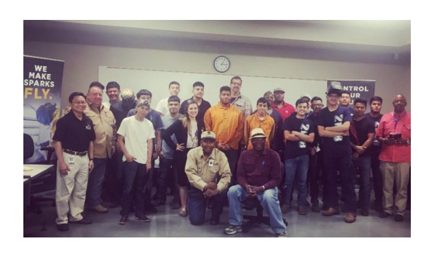
WeldAthon @ HCC Summer 2018