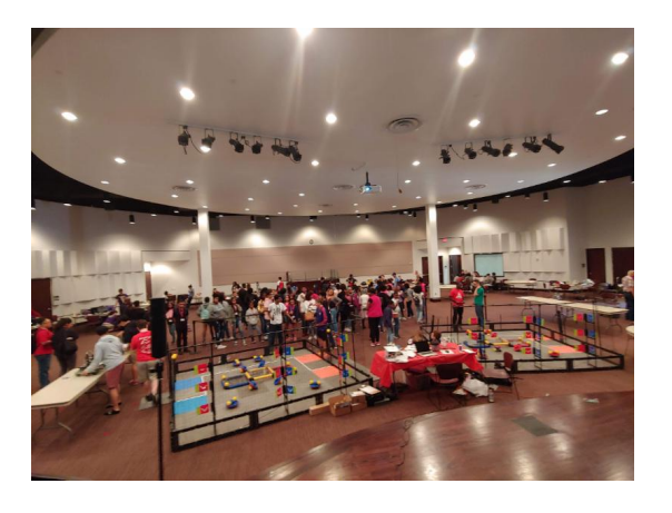
VeX Robotics Competition Fall 2018