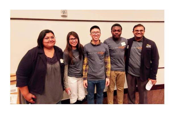
Student ChangeMakers & Entrepreneurs Recognized at RealHCC Summit!