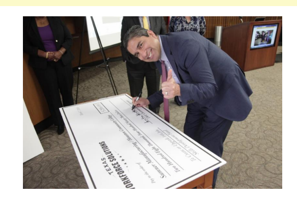
Texas Workforce Commission Summer 2018