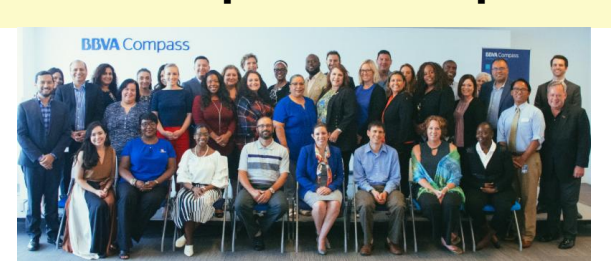
Financial Bootcamp Sponsored by BBVA Summer 2018