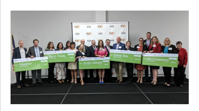
Business Plan Competition@HCC 2018 Winners