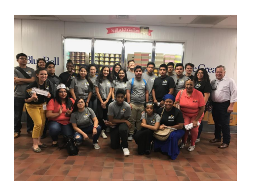
Bootcamp Empresarial Level Up Sponsored by The Morales Foundation Spring 2018