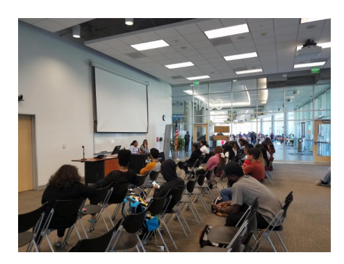
Girls in STEM @ HCC Central Campus Summer 2018