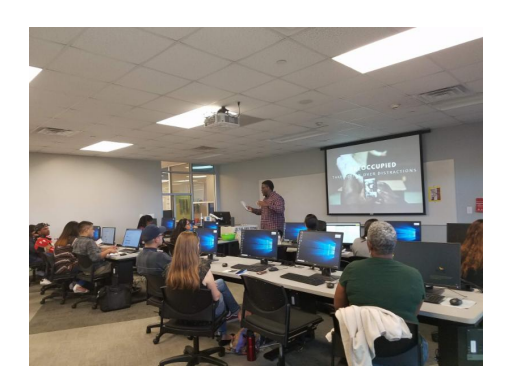
Free Opportunity Workshops@ HCC Libraries Taught by Students from the Innovation Club, 25 workshops conducted in 2018!