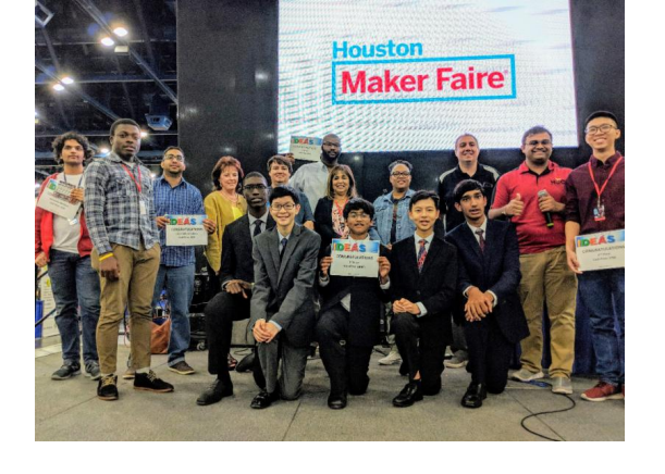
IDEAS Pitch Competition @ Houston Maker Faire Fall 2018