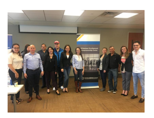
Spanish Canvas y Marketing 4 Business Workshops delivered in Spanish!