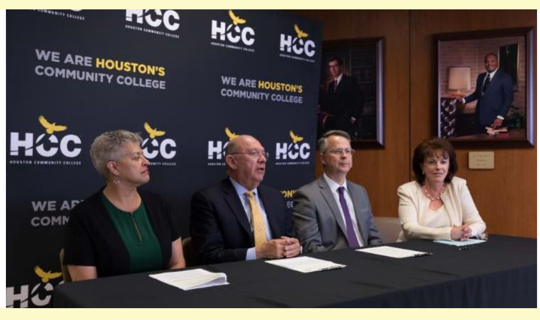
A Focus on Women Entrepreneurship