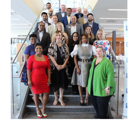
Cohort 22 Graduates