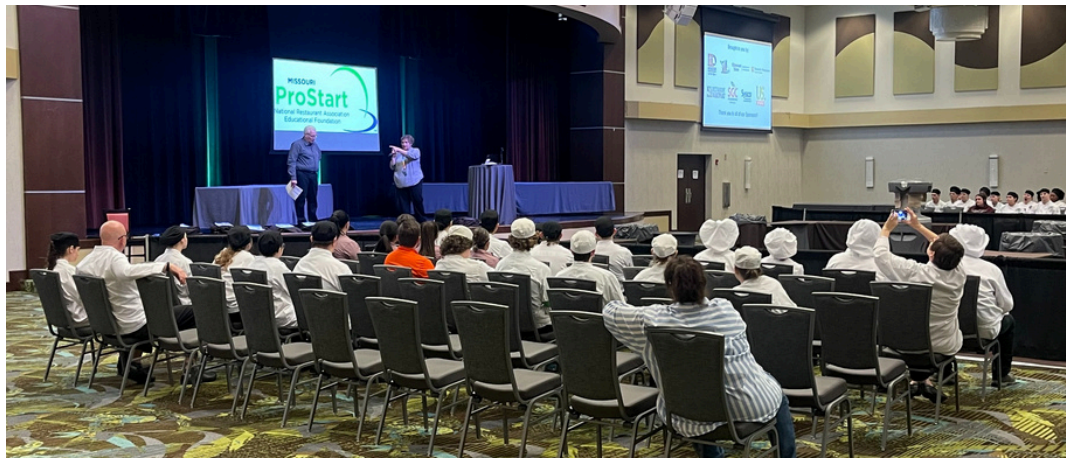
Missouri ProStart Competition